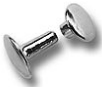
Nity dvojdielné sedlárske - uzavrené

» DOM, STAVBA, ZÁHRADA » DROBNÉ ŽELEZÁRSTVO